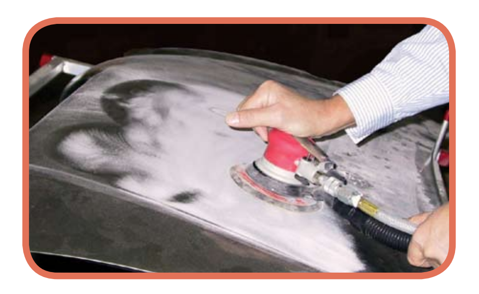
Most of the dust is collected with vacuum sanding.