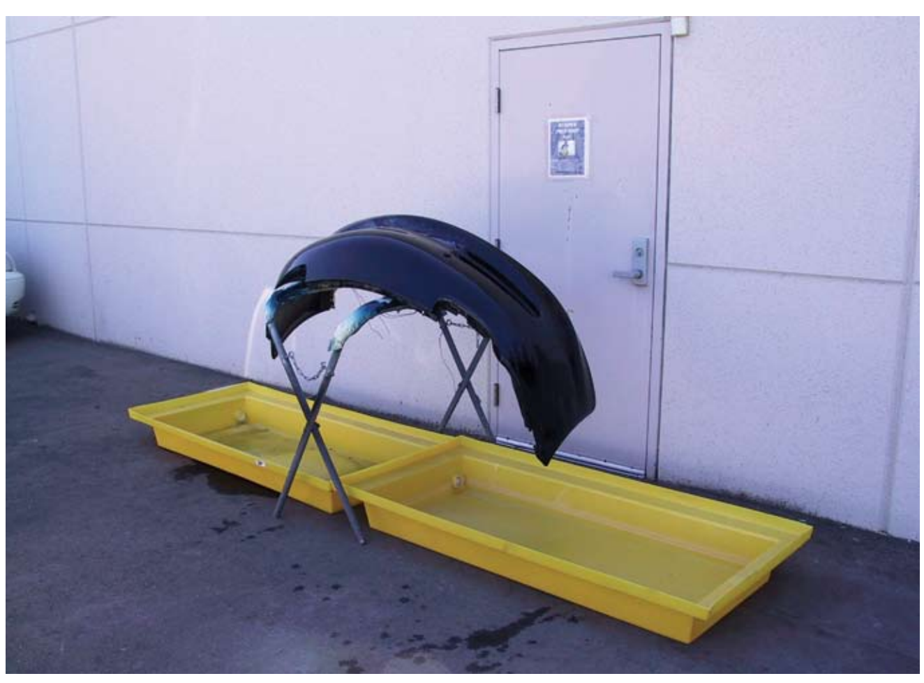
Drip pans collect wet sanding waste