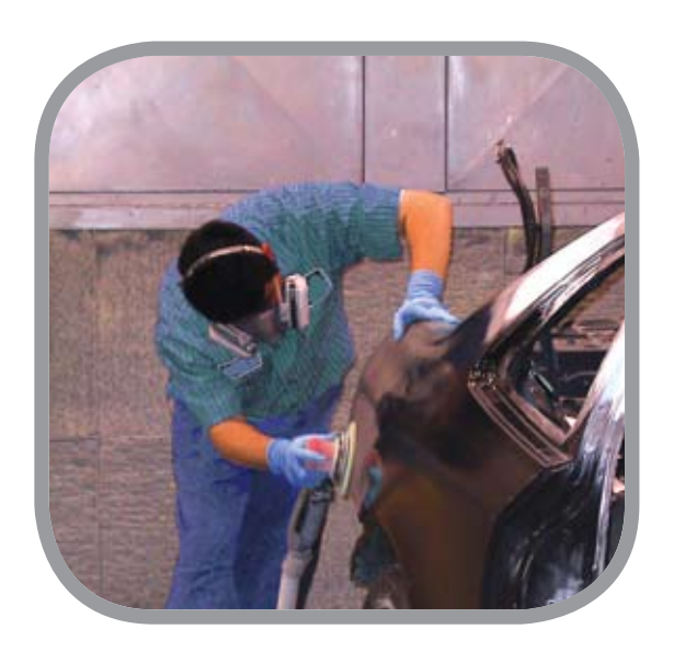
Sweeping is a good practice but vacuum sanding to keep waste off the floor is better