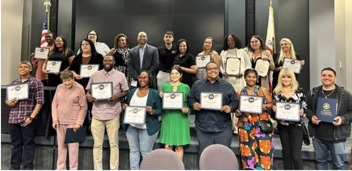
Pictured here are all the WDB nominees.