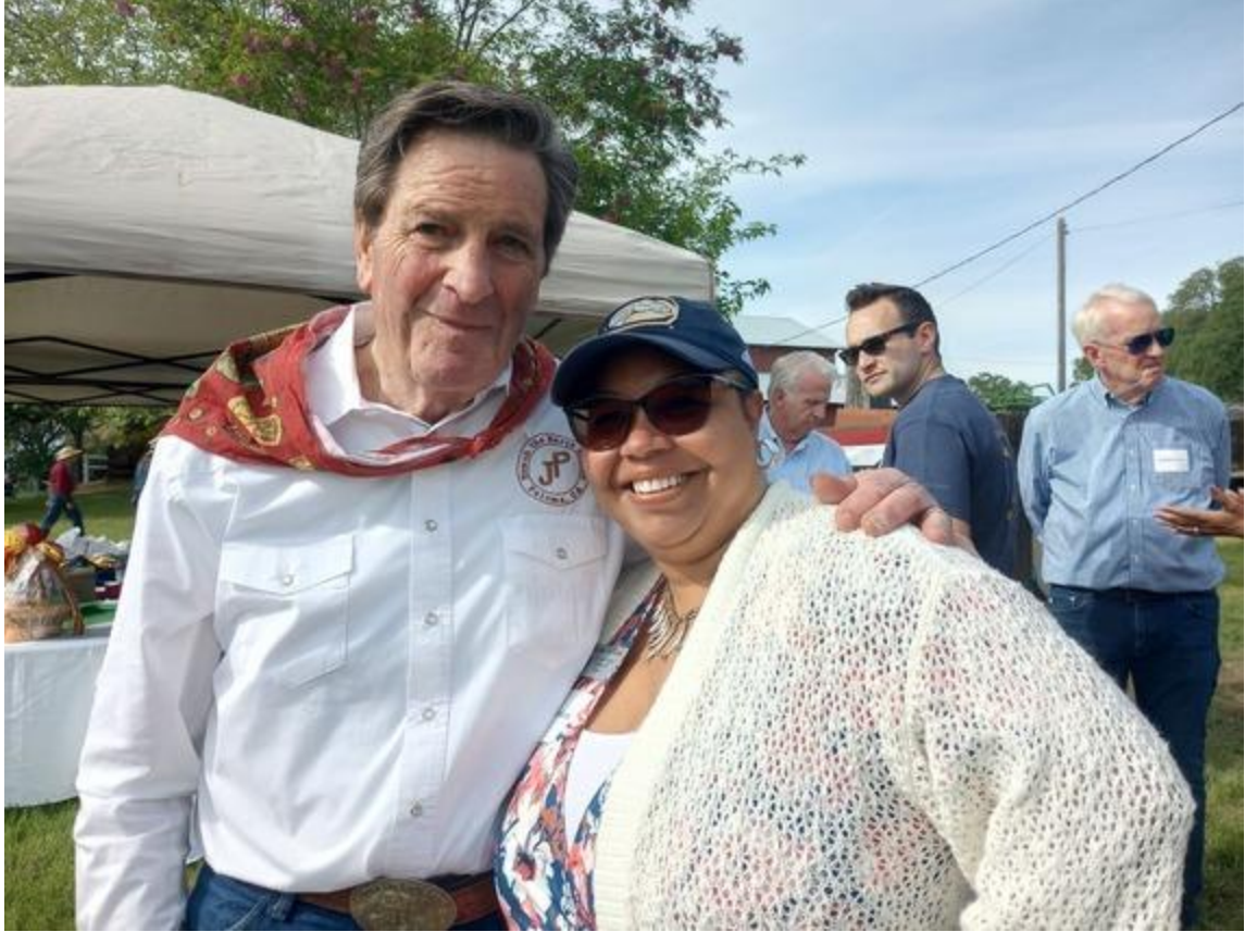
Congressman John Garamendi and Supervisor share a moment at the Congressman's annual Basque BB.Q on Saturday, April 27th in Valley Springs.