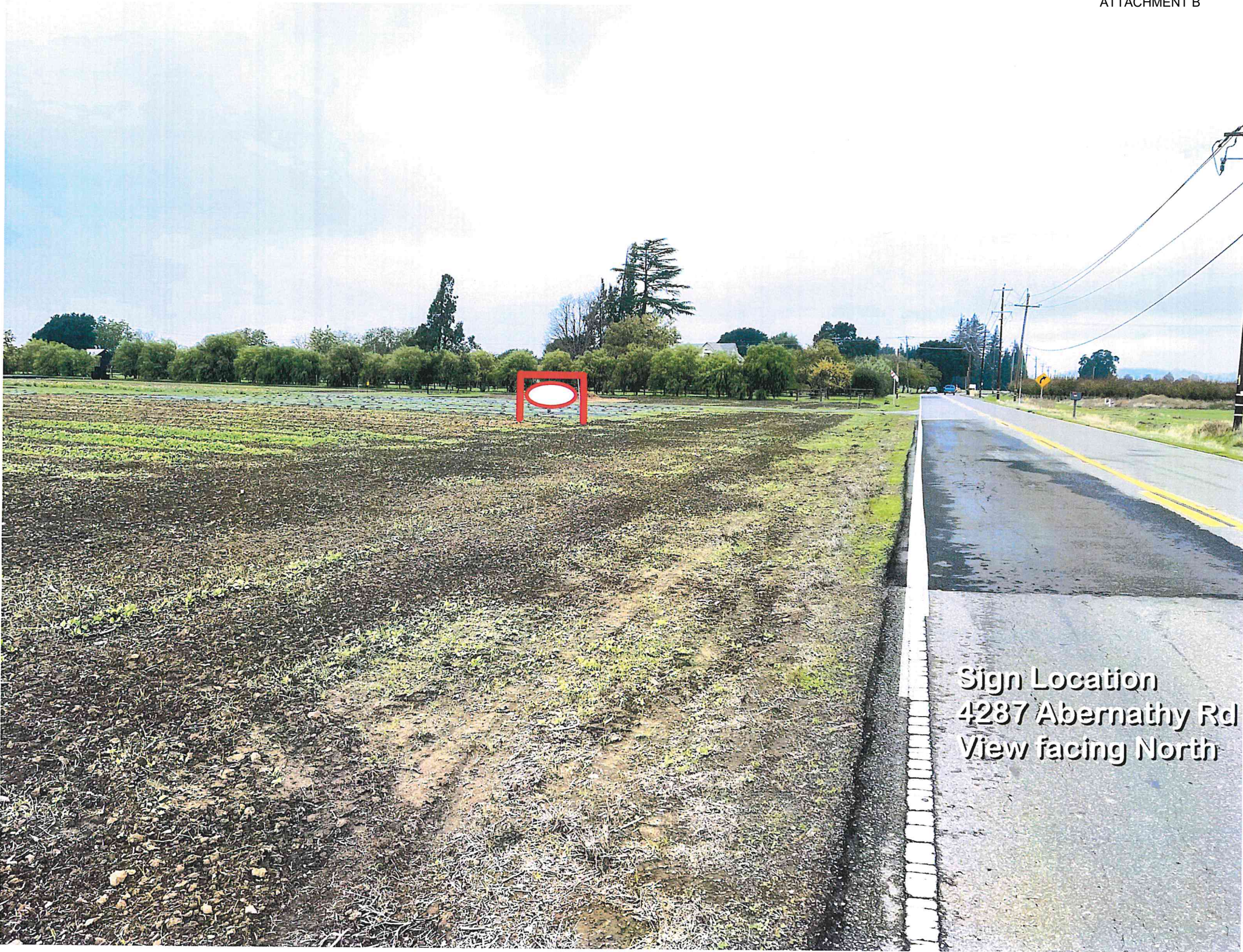
Sign Location 4287 Abernathy Rd View facing North