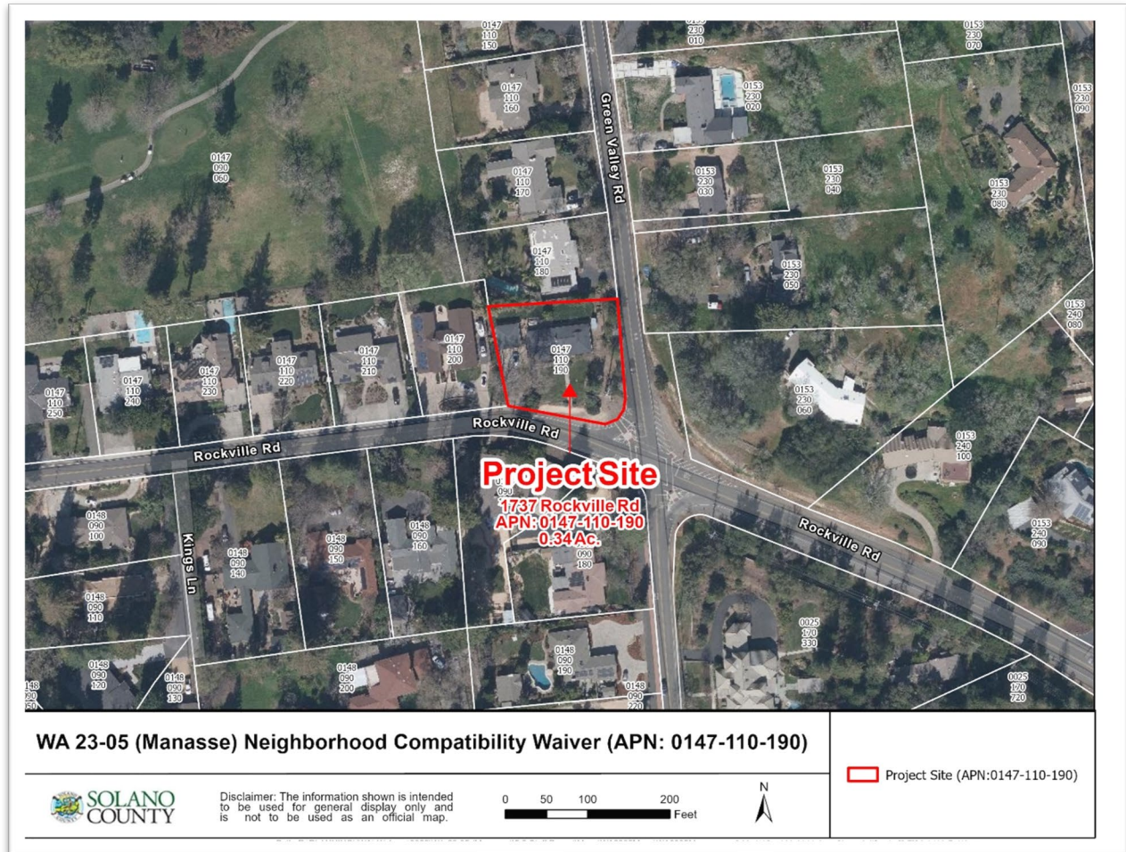
Figure 1 - Vicinity Map

The subject site, Assessor Parcel Number (APN 0147-110-190), is located at 1737 Rockville Road, 1.25 miles North of the City of Fairfield. The parcel is relatively flat and access is via existing driveways from Rockville Road. The existing development consists of a primary dwelling and a detached garage.