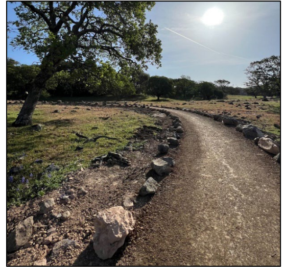
The All People’s Trail provides access and enjoyment to people of all abilities

This beautiful natural area features oak woodlands, seasonal creeks, diverse wildlife, and spectacular views. The park will support school field trips through educational signage, bus parking, potable water, and bathrooms. Visitors to the property will enjoy shaded picnic areas, a native plant garden, more than 11 miles of trails, and a .61 mile All People’s Trail which will allow people of all abilities to enjoy the health and wellness benefits of access to nature.