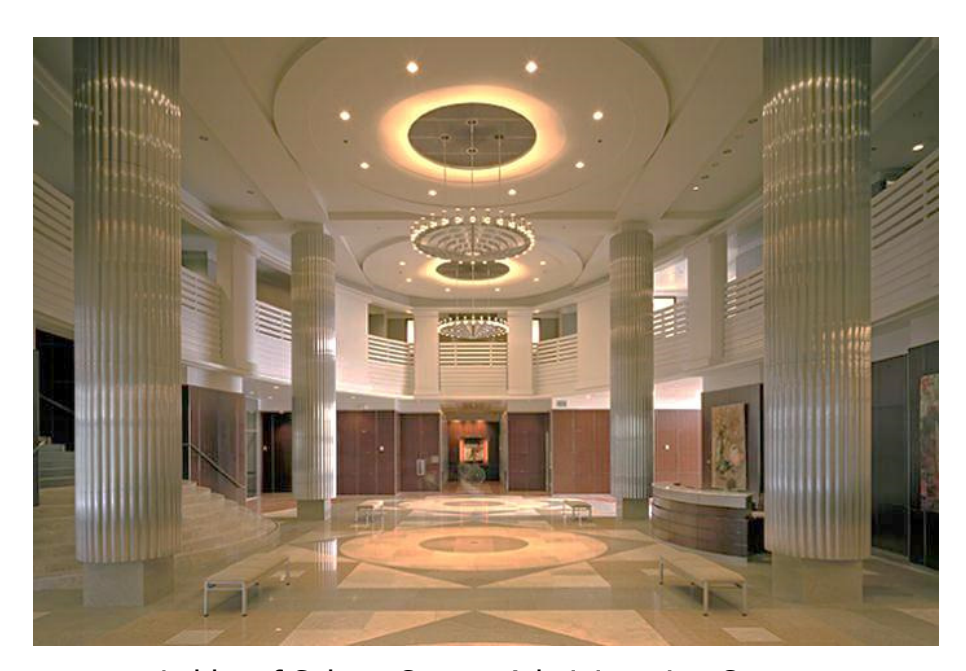
Lobby of Solano County Administration Center

Registrar of Voters County Administration Center 675 Texas Street, Suite 2600 Fairfield, CA 94533 (707) 784-6675 www.solanocounty.com/elections