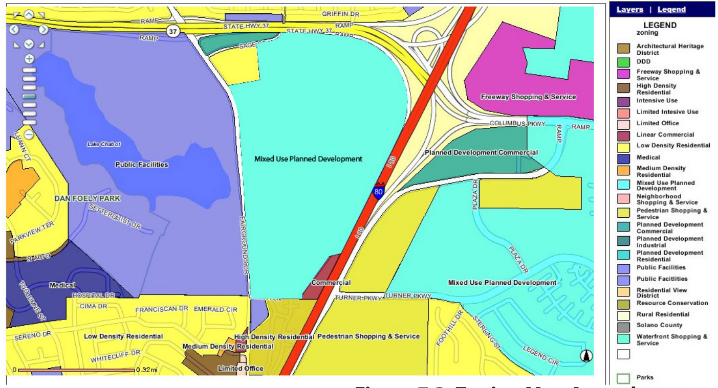
Figure 7.2: Zoning Map Amendment