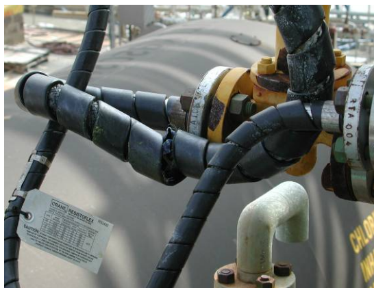
Figure 2. Honeywell ruptured chlorine transfer hose

The August 2005 incident at Honeywell demonstrated that properly maintained chlorine detection and emergency shutdown systems are critical for protecting workers, adjacent communities, and the environment.