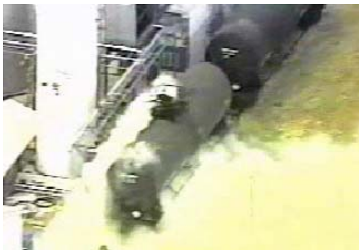
Figure 1. August 14, 2002, chlorine release at DPC Enterprises in Festus, Missouri

This bulletin compares two chlorine releases investigated by the CSB. In both, a railcar unloading hose failed and chlorine was released. In the first incident, an emergency shutdown system malfunctioned, resulting in a release of 48,000 pounds of chlorine and a significant community impact. In the second, the emergency shutdown system worked to minimize the release, and the community was not impacted.