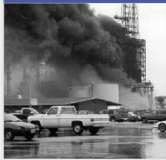
● Figure 1. Equilon Enterprises oil refinery fire.

Once steam was restored, the operators were unsuccessful in attempting to inject it into the drum through the normal route because