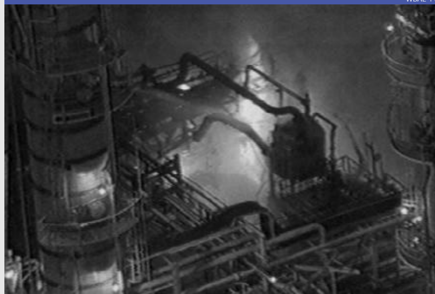
● Figure 4. CONDEA Vista plant fire.

● The higher density material—combined with problems related to initial overfeeding of the aluminum—overtaxed the mixing capability of the agitator and allowed aluminum to settle in the bottom of the reactor, where it plugged the lower nozzle and accumulated as sludge.