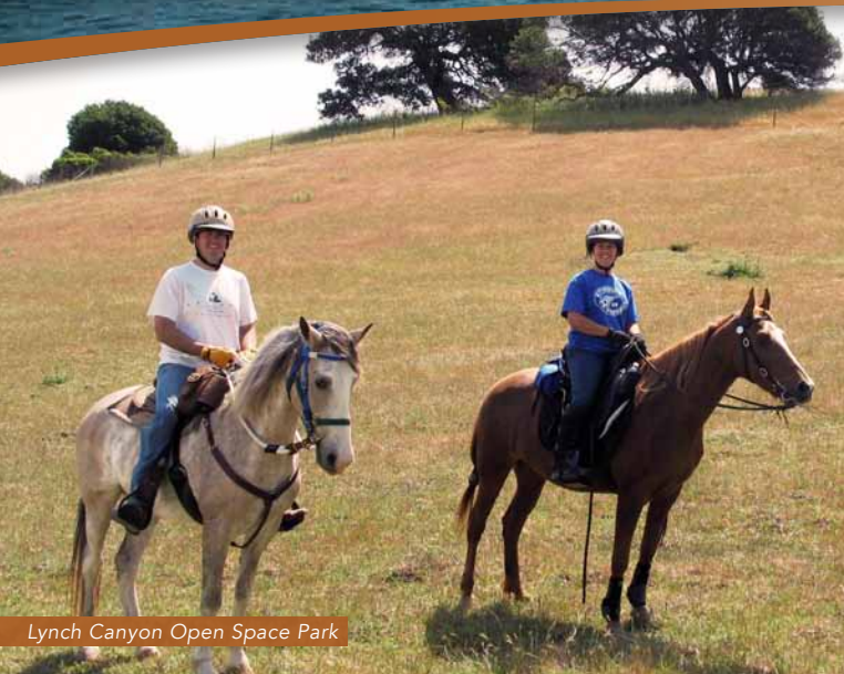
Lynch Canyon Open Space Park