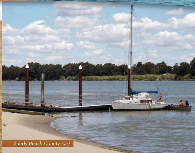
Sandy Beach County Park