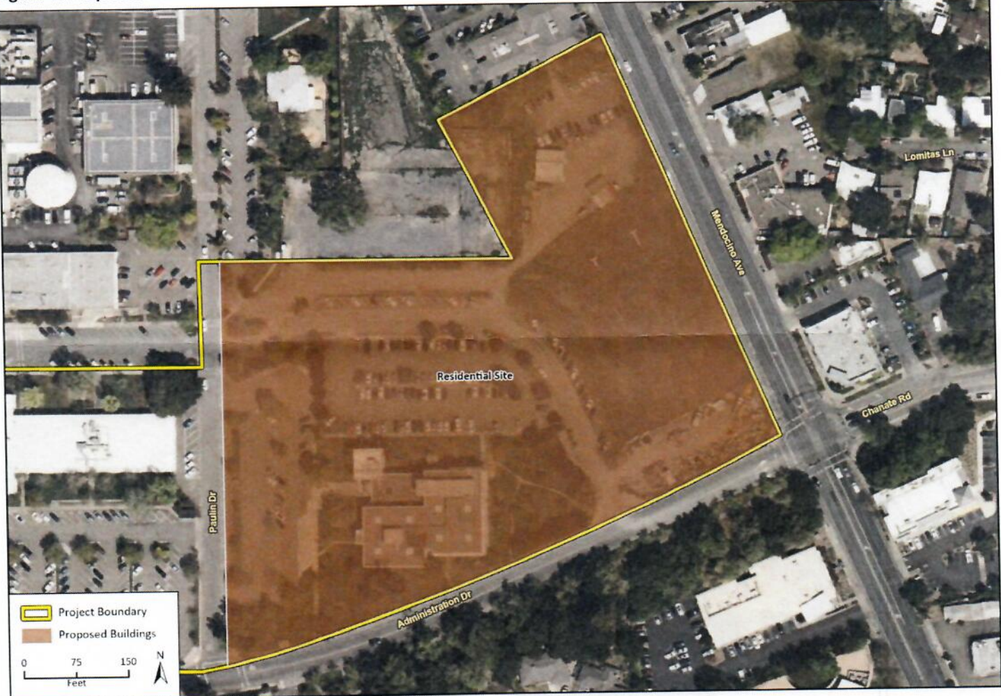
Figure 4: Proposed Residential Site