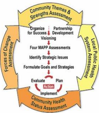
The MAPP Model