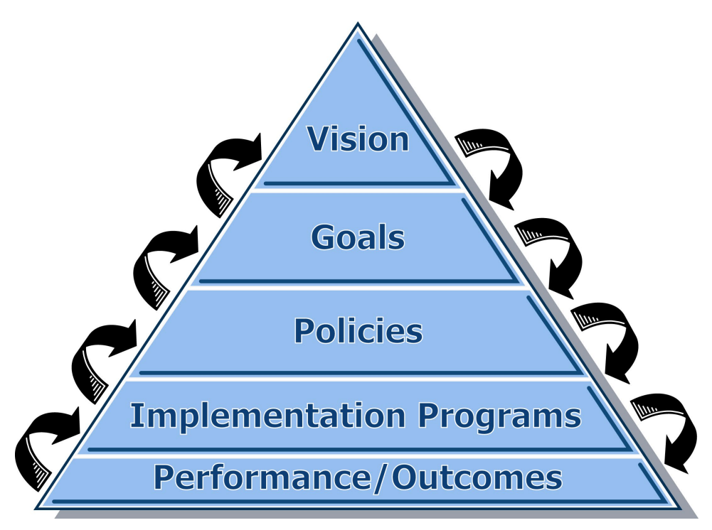
Figure IN-2 Policy Pyramid Diagram

Figure IN-2 illustrates the interconnected nature of the various elements. The vision describes expectations of county residents regarding how future land use and conservation decisions will affect the environment, economy, and social equity within the county. Goals are expressions of desired outcomes that are more specific than the vision. Goals consist of broad statements of purpose or direction. Policies serve as guides to decision makers and County staff in reviewing development proposals and making other decisions that affect development and conservation in Solano County. Implementation Programs identify specific actions to achieve the goals, policies, and plans identified in each General Plan section.