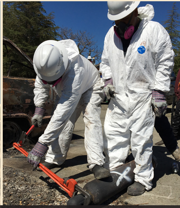
Fire recovery crews from the California Department of Toxic Substances Control (DTSC) work to cleanup properties that were impacted by the LNU Lightning Complex fire in Solano County - September 2020